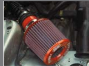
Cotton filter with metal top